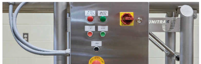
Control panel - NEMA 4X

Special "tilt" feature that allows conveyor to be dropped to a horizontal position to facilitate easy cleaning and/or enable the unit to be moved to a cleaning location. Electric actuator safely pivots the conveyor from the "Working" to "Cleaning" position, with a simple press of a button on the control panel.