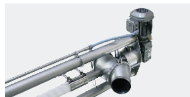
Discharge chute & drive assembly