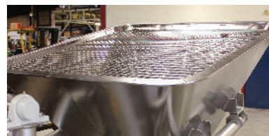
Bolted-in safety grate