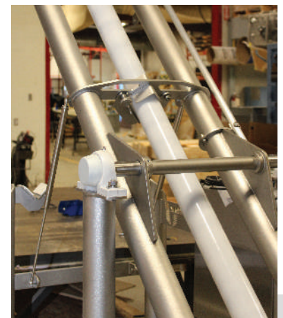
Auger casing - 3" or 5"; UHMW or stainless steel